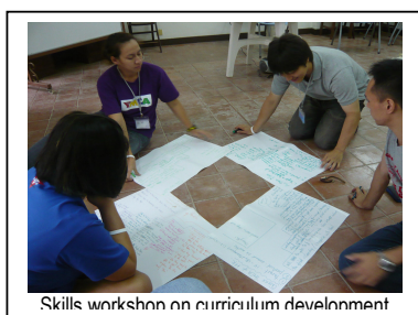
Skills workshop on curriculum development