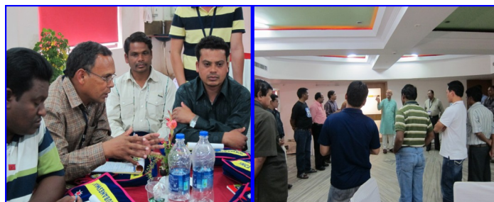
Nearly 30 people attended the workshop "Breaking Walls, Building Bridges" hosted by the YMCA in Bhubaneswar in the Indian state of Orissa. Much of the learning was based on the experiences of the participants themselves, who discussed in small groups the violence in Orissa involving different faith communities and ways to respond to it that can foster peace.

It was in this context and a similar explosion of violence in Kandhamal on Christmas Eve in 2007 that the interfaith