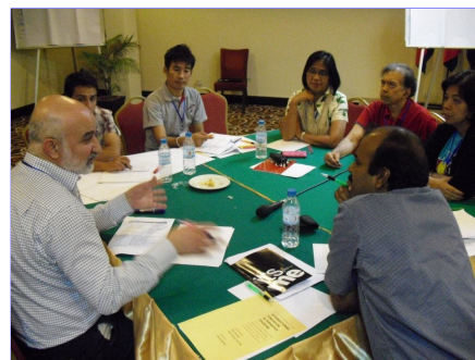
GATN Meeting in Cambodia

The GATN encourages the YMCAs to monitor the negative impacts of tourism and to transform communities/societies. Personally, GATN increased my knowledge and raised my awareness on gender sensitivity, child pro-