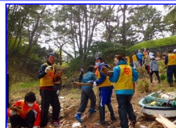
YMCA volunteers in Japan take action in responding with the March 2011 earthquake.

Related documents about the program were already circu-